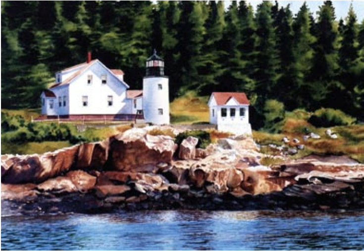
Karol B. Wyckoff, ASMA, “Lighthouse Solitude” Watercolor 21.5”x 14.5”