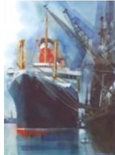
Back Cover: Donald Stoltenberg, FE/ASMA "SS AMERICA in Southampton" Watercolor 18.5" x 13.75"