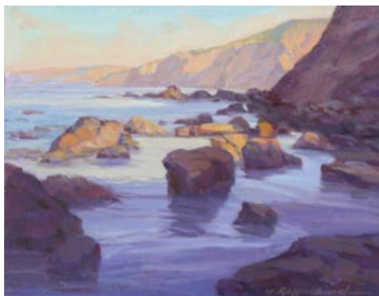
Gerrye Riffenburgh, ASMA “Morning Tides” Oil 14”x 18”