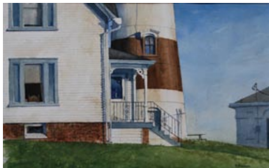
Bob Perkowski, ASMA “Stratford Light Windows” Watercolor 14”x 22”