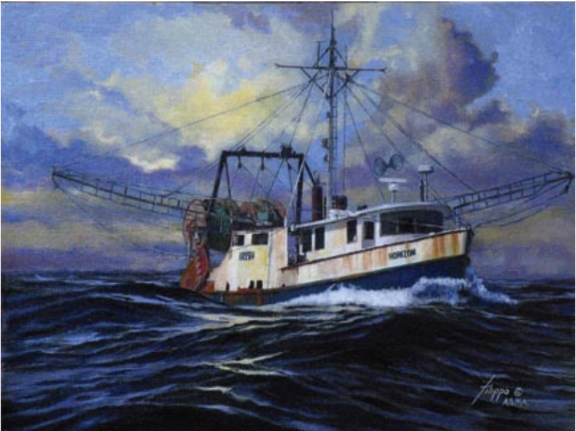
Phil Cusumano, ASMA, " The HORIZON " Oil 12" x 16"