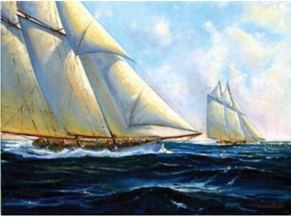
Brad Betts, ASMA "ALTAIR on the Wind" Oil 12" x 16"