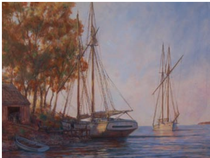
Jon Olson, ASMA “Loading Ice at Little Sturgeon Bay” Oil 18”x 24”