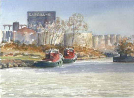
Mike Killelea, ASMA “Two Tugs in the Buffalo River” Watercolor 9”x 12”