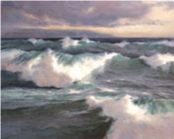
Front Cover: Don Demers, F/ASMA "Storm's Wake" Oil 16" x 20"