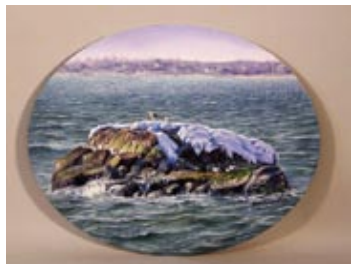
Janice Sexton “Winter’s Watch” Oil 16”x 20”