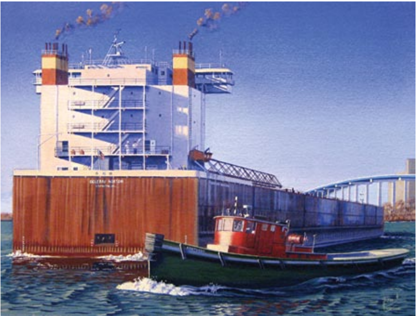
Ed Labernik, “Turning to Port”